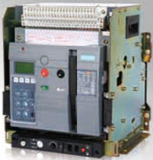
Air Circuit Breaker